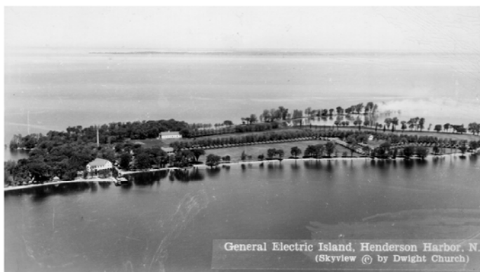
General Electric Island, Henderson Harbor, N.Y.

After receiving the island in 1959, the YMCA ran a