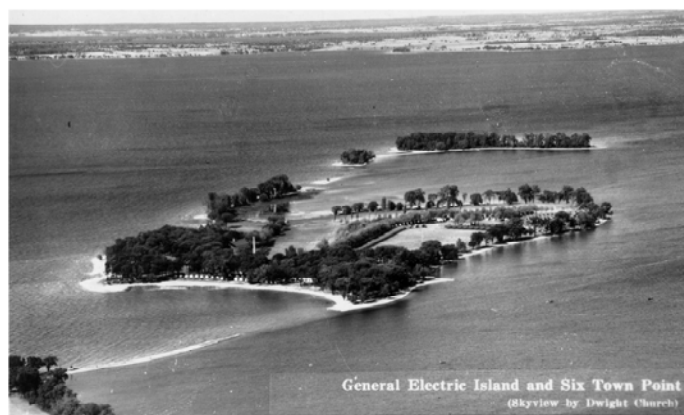
General Electric Island and Six Town Point

boy's summer camp on the island for several years until abandoning it after 1967.