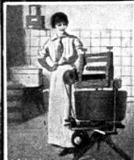
No "Blue Mondays" when a G-E Motor runs the washing machine.