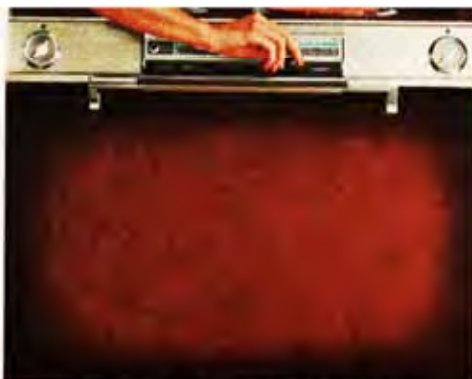
just set dials, latch the door...