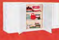
G-E Steel Cabinets. Plenty of food-and-utensil storage space; extra work surface, too.

General Electric Co. Box 8-10-CC, Louisville 2, Ky.