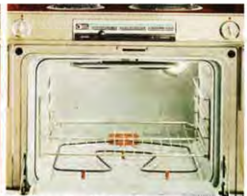
it cleans itself electrically.

There isn't, there can't possibly be, a more exciting range in the whole world today.