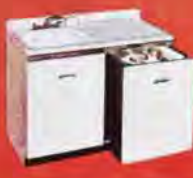
G-E Dishwasher & Sink. Dishes automatically rinsed, washed, and dried with heat.