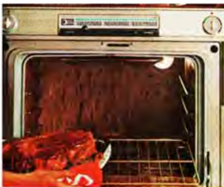
Don't touch this dirty oven...