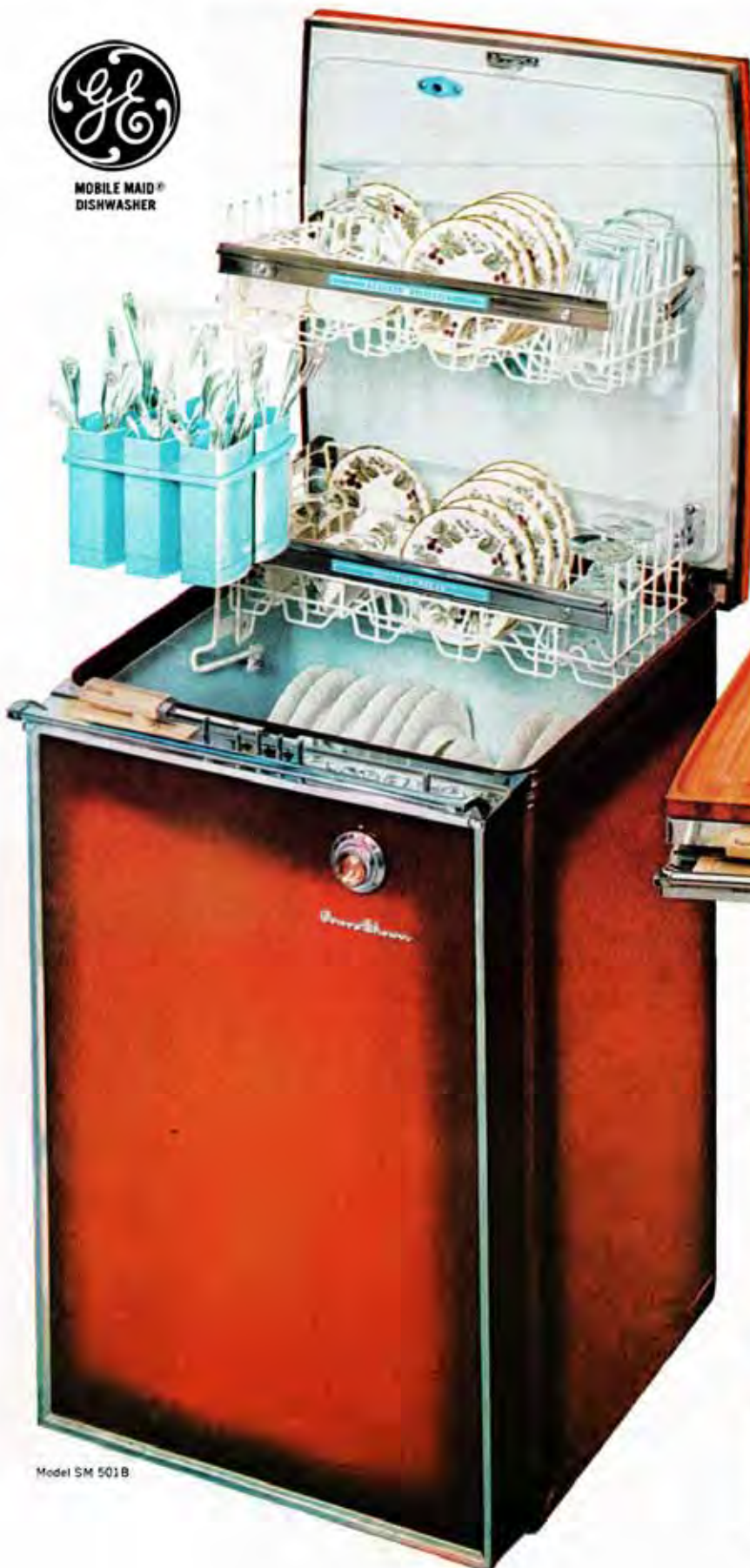
Model SM 501B