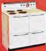
G-E "Speed Cooking" Range. It's fast, safe! The automatic features make grand meals easy!