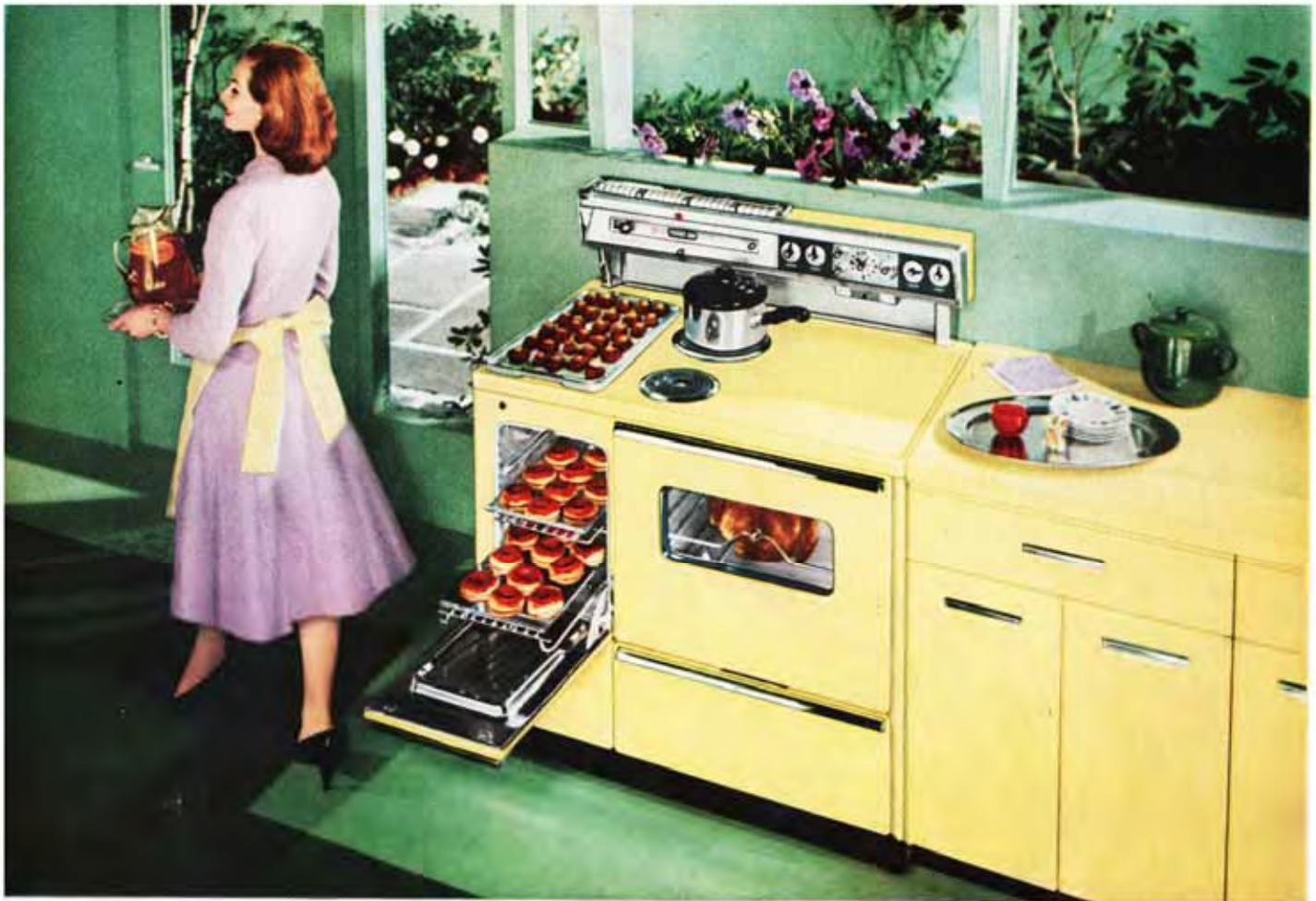
Model J-408. $4.12 weekly—after small down payment. 36 months to pay.