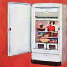
G-E 8-cu-ft Refrigerator. "Space Maker" model. World-famed for dependable service.