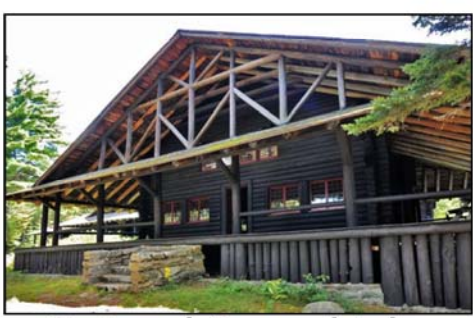
Santanoni, Newcomb Lake