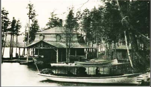
The Hedges, Blue Mountain Lake