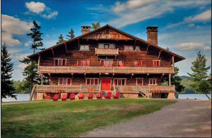
Sagamore, Raquette Lake

Thursday, April 25, 2024 Luncheon, followed by Program "Greetings From The Great Camps - The History Of The Adirondack Vacation"