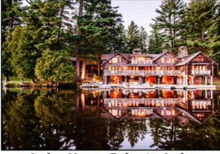
Lake Kora, Private Lake