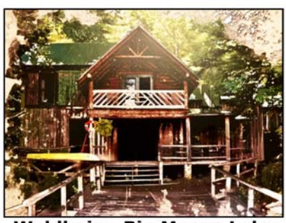
Waldheim, Big Moose Lake