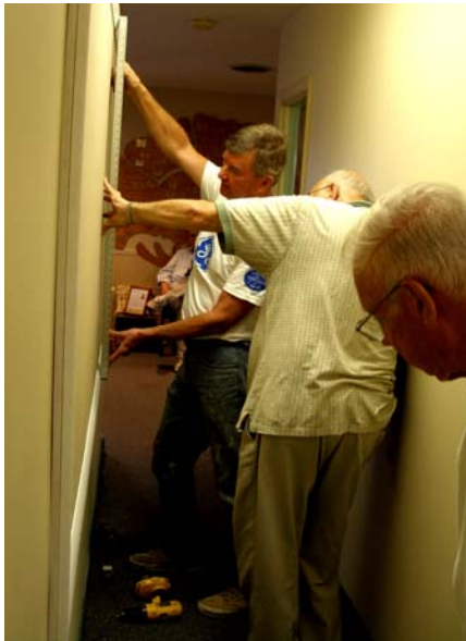
Hope for Bereaved