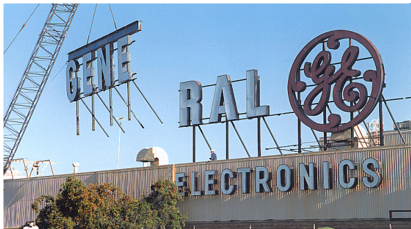
Photo of the sign removal on September 27, 1993