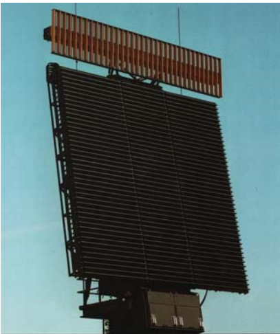
FPS-117 Solid-State Radar

More interesting however, is how the plot makes use of military technology – including several systems developed by General Electric in Syracuse and Utica and mentioned many times in the book: